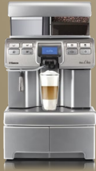
Aulika Top RI