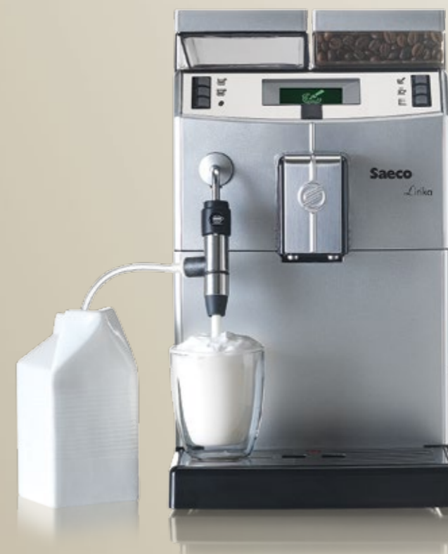
Lirika Siluro Cappuccinatore

Stainless steel Siluro cappuccinatore, to be mounted on the steam wand for the frothing of creamy cappuccinos and milk drinks. It can be used also in combination with the Milk Cooler.