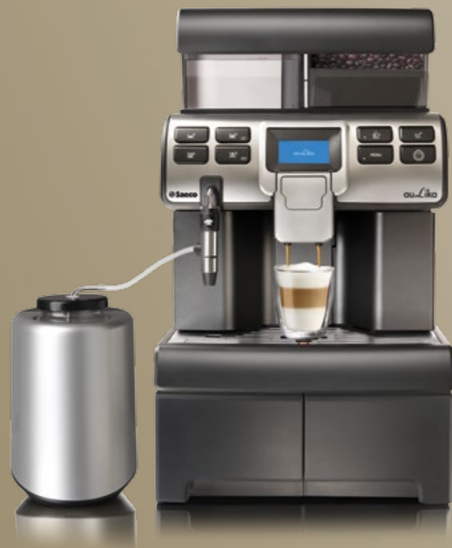
Aulika Mid Base

Painted metal and ABS matt black base, in family feeling with Aulika Mid, with 2 drawers for sugar bags, stirrers etc. Its use with the machine is suggested if the Astra refrigerator or Milk Cooler are present.