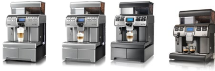
Aulika Top RI